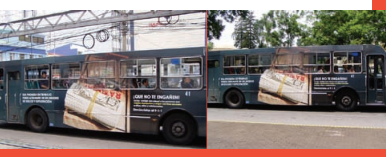
Buses featuring the advertisements circulated for four months in the most at-risk areas identified as trafficking routes