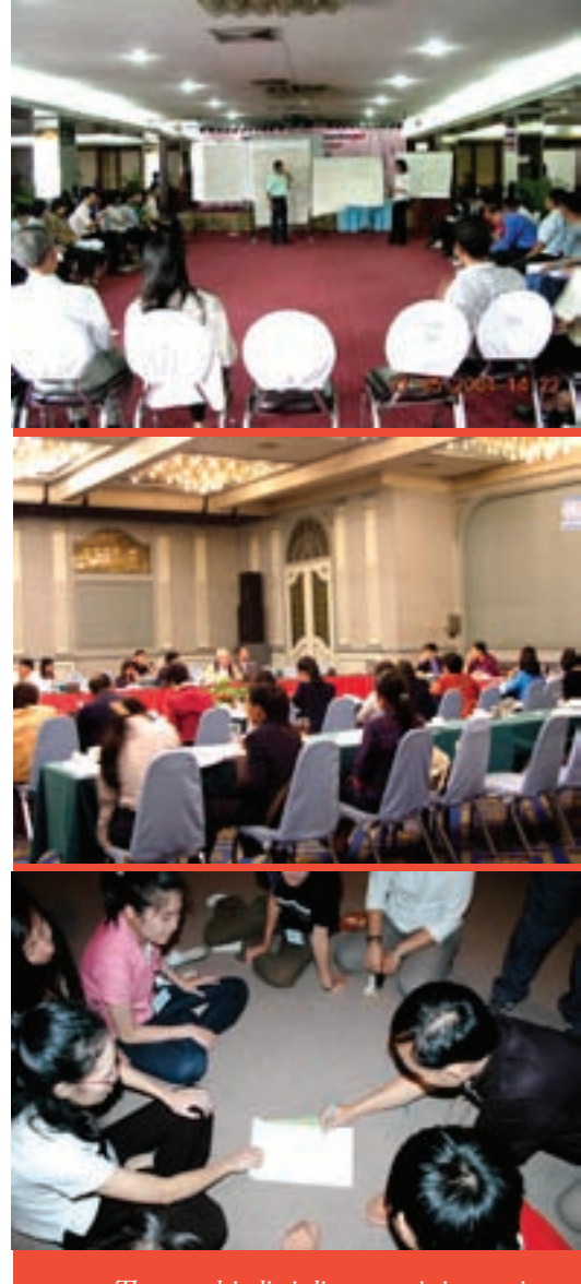
Three multi-disciplinary training sessions took place between August and October 2005 in the central, northern and southern provinces of Thailand

With regard to methodology, the training manual includes techniques such as case studies, case conferences and role playing, through which not only can attitudes towards trafficking be changed, but different