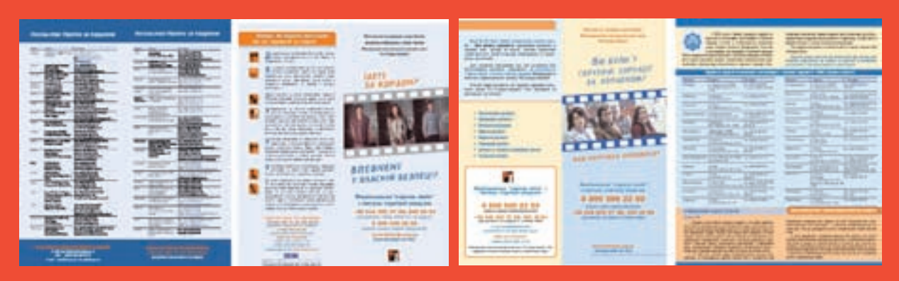
Information materials with tips to prevent human trafficking, including contact details for the hotline

Data provided by La Strada shows that the hotline usage by vulnerable children and adolescents, parents, caregivers and the public increased significantly when tied to the broadcasting of television advertisements on the fight against CSEC and child trafficking. Therefore, advertising the specialised services of the hotline and linking them with an awareness raising campaign can be an effective outreach tool for the at-risk group. In this connection, La Strada received free airtime from a local advertising agency and reduced tariffs for the hotline from a telecommunications. company. Such in-kind contributions made a big difference in reducing the costs of implementing the practice, while allowing the use of local resources and creating significant partnerships with the private sector