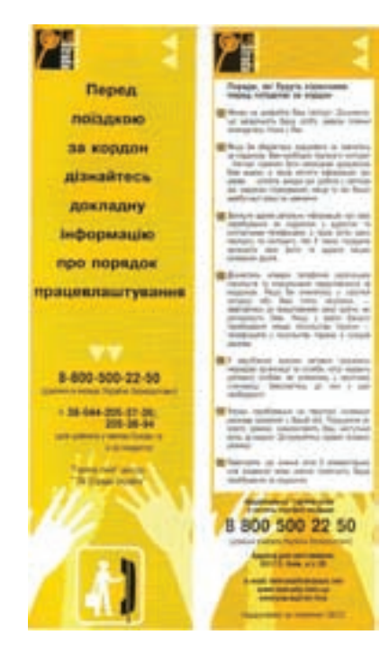
A leaflet advertising the hotline

on Minor's Affairs under the Ministry of Interior, to start an investigation. In the meantime, an individual rehabilitation and social reintegration plan for the child is developed, and depending on the circumstances, the child may return to his/her family or relatives, or be placed within a state establishment for children Education or professional courses, together with medical and long-term psychological support, are also provided. In order to ensure these services, La Strada cooperates