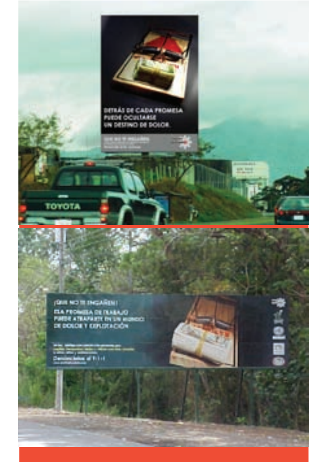
Billboards located at the headquarters of the General Directorate of Immigration in San José and at border crossings with Nicaragua (Penas Blancas)

Paniamor established strategic alliances with major television and radio stations and secured time slots allotted for public service programmes. In addition to reducing the costs of the campaign, these partnerships made it possible to