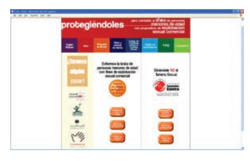
Homepage of the website www.protegiendoles.org

To ensure adequate visibility of the campaign and increase its impact, it was launched during a press conference in San José in February 2006. The event was attended by relevant government