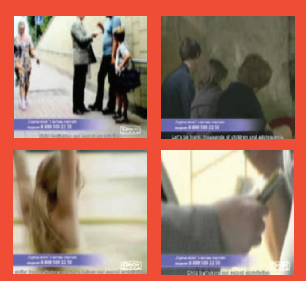
Shots from the TV advertisement produced by La Strada