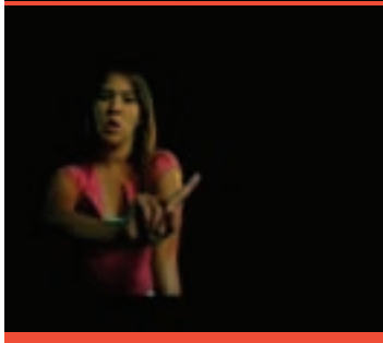
Shots from the TV advertisement produced by Paniamor