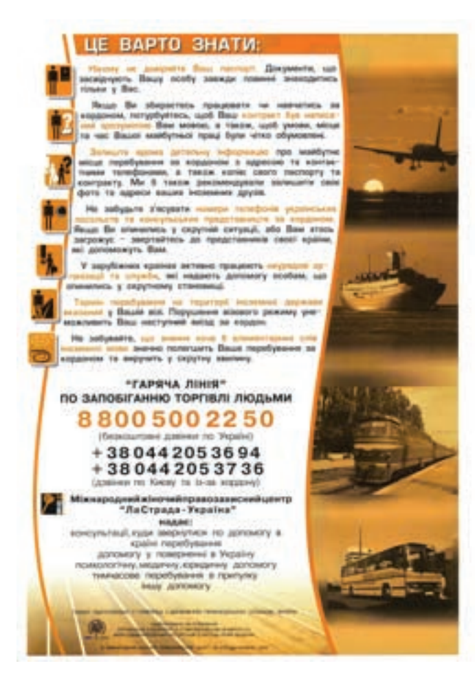
La Strada increases awareness of its hotline on human trafficking through posters and other materials

specific needs of the trafficking survivor, the hotline provides a plane ticket, first aid, emergency psychological counselling, and legal assistance, or refers the case to their national NGO partner network and